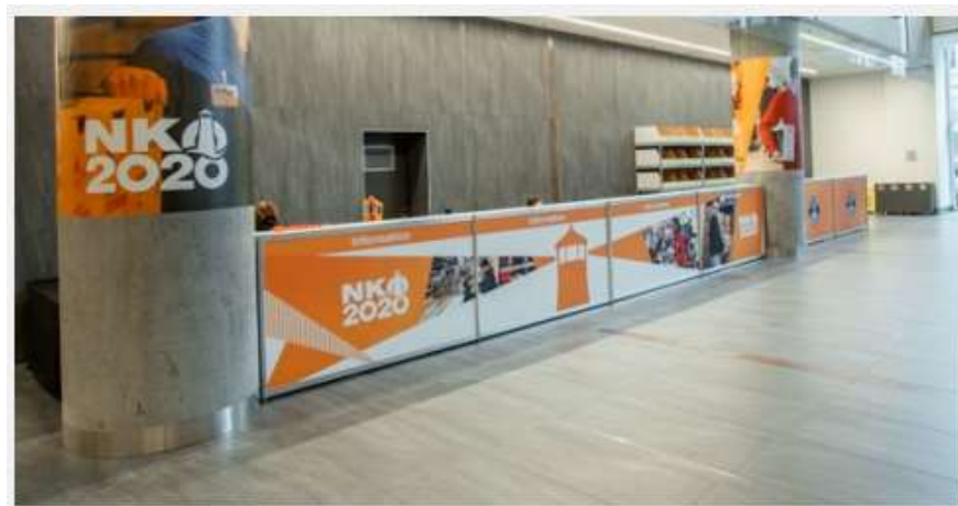
Example of sponsored registration.

Become the exclusive sponsor of the registration process and ensure that attendees are greeted by your brand from the moment they arrive. Your company's logo will be prominently displayed on registration signage, kiosks, and digital platforms, creating a strong visual presence that establishes your brand as a trusted partner in the trade show experience. Your logo will also be featured on the registration staff uniforms, serving as a walking advertisement for your brand. Limited to 1 sponsor.