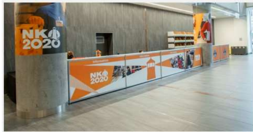
Example of sponsored registration.

Become the exclusive sponsor of the registration process and ensure that attendees are greeted by your brand from the moment they arrive. Your company's logo will be prominently displayed on registration signage, kiosks, and digital platforms, creating a strong visual presence that establishes your brand as a trusted partner in the trade show experience. Your logo will also be featured on the registration staff uniforms, serving as a walking advertisement for your brand. Limited to 1 sponsor.